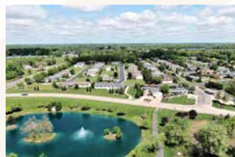
TWO CONFIDENTIAL MHC'S

Sale Date: April 2025 Location: Florida Units: 285