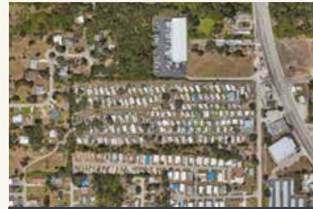
CONFIDENTIAL FLORIDA MHC

Sale Date: August 2025 Location: Florida Units: 250+