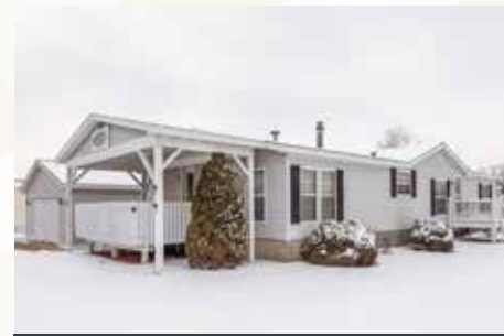
UPPER MIDWEST PORTFOLIO

Sale Date: October 2022 Location: Arizona Units: 300+