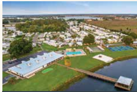
AGE RESTRICTED MHC

Sale Date: November 2025 Location: Washington Units: 125+