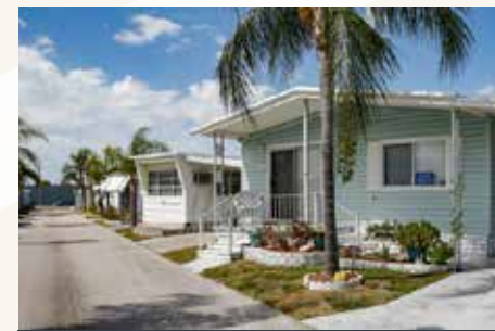
CONFIDENTIAL 4 MHC PORTFOLIO

Sale Date: June 2022 Location: Washington Units: 66