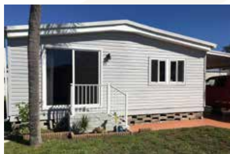
2 MHC PORTFOLIO

Sale Date: July 2023 Location: West Coast Units: 100+