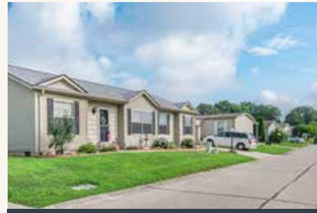
AGE RESTRICTED MHC

Sale Date: December 2025 Location: Georgia Units: 250+