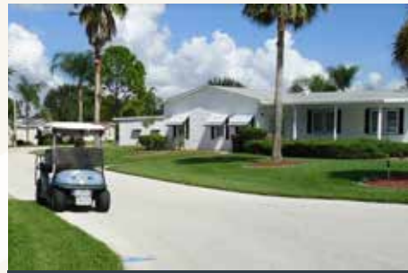
CONFIDENTIAL FLORIDA MHC

Sale Date: October 2025 Location: Florida Units: ~550