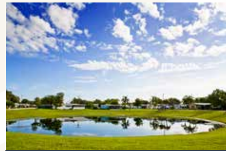
WINTER HAVEN MHC

Sale Date: September 2022 Location: South Dakota Units: 750+