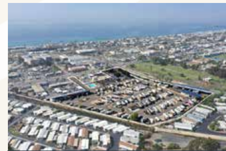
CONFIDENTIAL RV RESORT

Sale Date: September 2022 Location: California Units: ~80