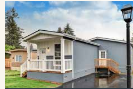
CONFIDENTIAL WEST COAST

Sale Date: August 2023 Location: Maine Units: 681