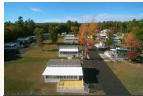
CONFIDENTIAL RV RESORT

Sale Date: November 2021 Location: New Jersey Units: ~300