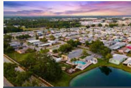
2 MHC PORTFOLIO

Sale Date: February 2026 Location: Florida Units: 317