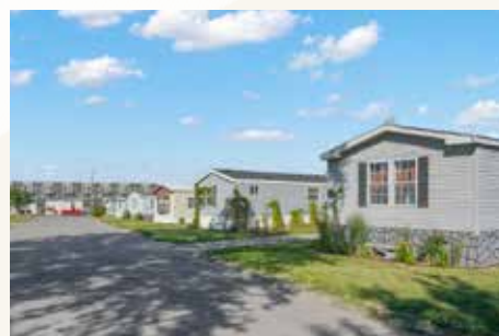
TWO CONFIDENTIAL MHC'S

Sale Date: December 2024 Location: Colorado Units: 375+