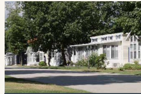
3 MHC PORTFOLIO

Sale Date: November 2023 Location: Nationwide Units: 7,665