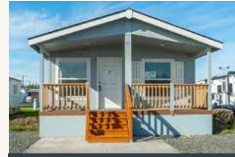
CONFIDENTIAL TEXAS MHC

Sale Date: July 2024 Location: Idaho Units: 92